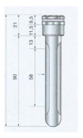
AX-TC-FS Fixing spring to fix the complete product in the appropriate slots in the flanges and in the pockets